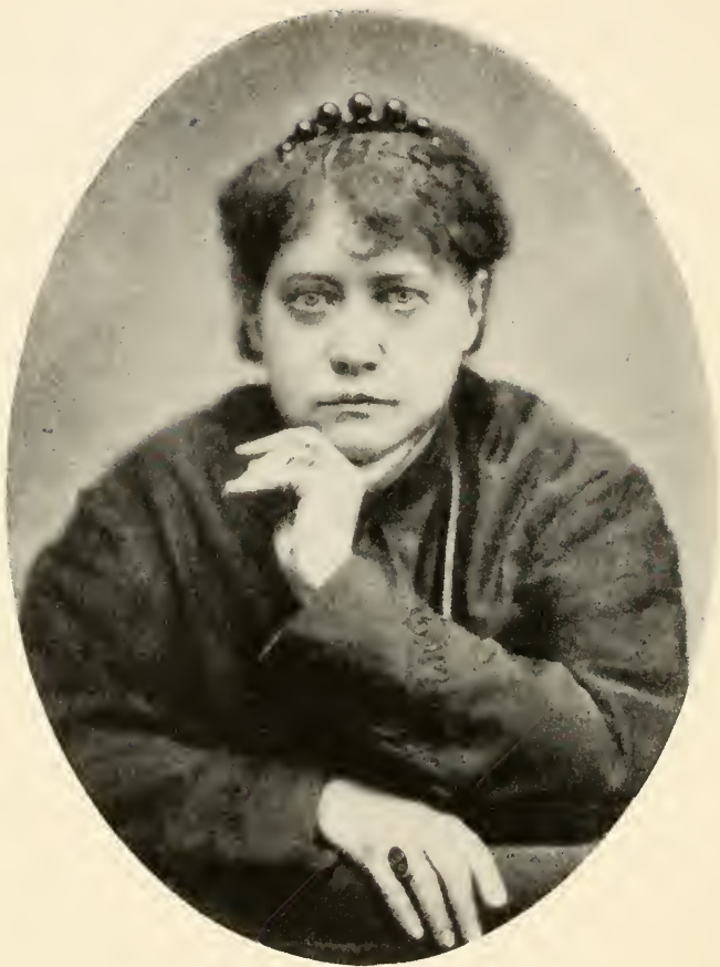
HELENA PETROVNA BLAVATSKY FOUNDERESS OF THE THEOSOPHICAL MOVEMENT